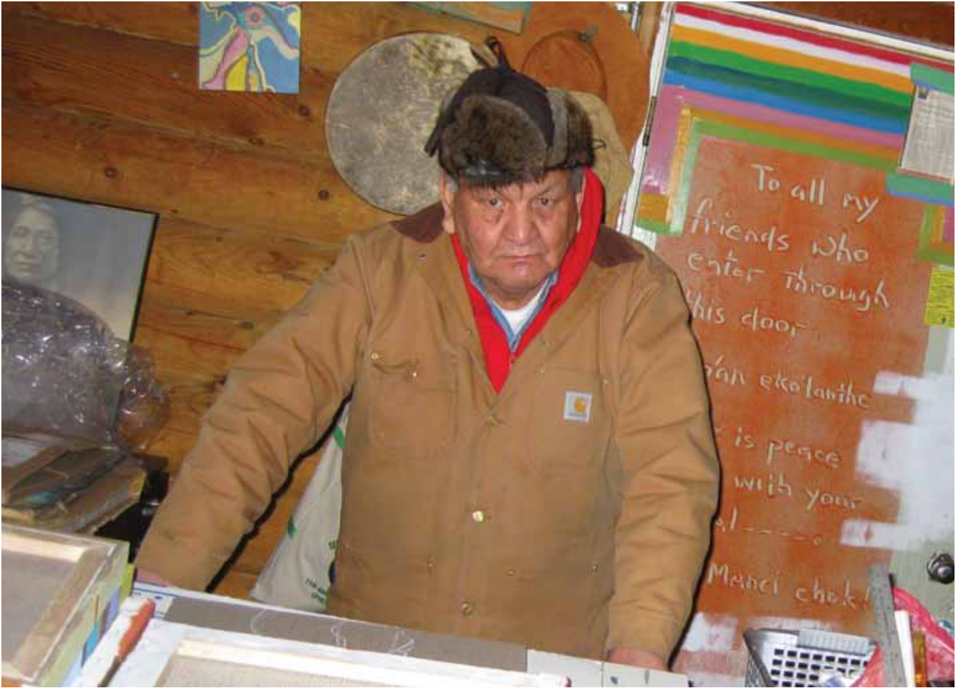
Alex Janvier's gentle humour and soft-spoken manner are betrayed by the reservoir of strength reflected in his paintings.

claims to the land. He explains his current position that the “domineering culture” has made a mess of the territory, which it “rents from natives,” and that it’s time “Indians become the landlords again.”